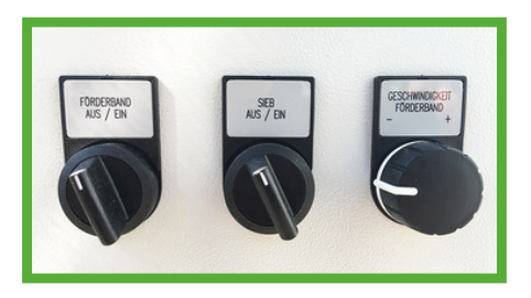
High-quality control incl. frequency converter