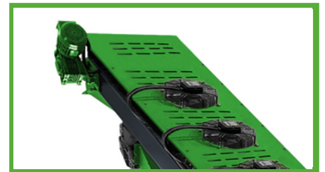
Energy-efficient cooling fans with only 55 watts consumption per fan/hour