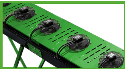
Nine integrated fans ensure uniform and rapid cooling of the pellets

The ECOKRAFT KFB cooling conveyor offers a wide range of advantages and is ideally suited for cooling and onward transport of pellets. With its effective cooling capacity, it significantly shortens the waiting time before packaging or storage. Its high energy efficiency speeds up the cooling process. The cooling conveyor can be seamlessly integrated into the production process and is available in various lengths, widths and configurations to meet individual requirements.