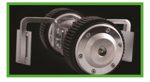
The roller set is designed as a well thought-out, quickly exchangeable and thus user-friendly complete unit.